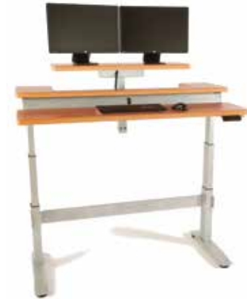
Ergonomically correct for people 6' 4" in a standing position