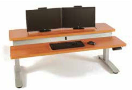
Ergonomically correct for people 5'0" in a seated position

The two tier design provides proper sitting and standing ergonomics for a wide range of people between 5' and 6' 4" tall.